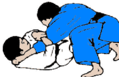
Gyaku Ude Garami