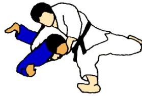
Sode Guruma Jime